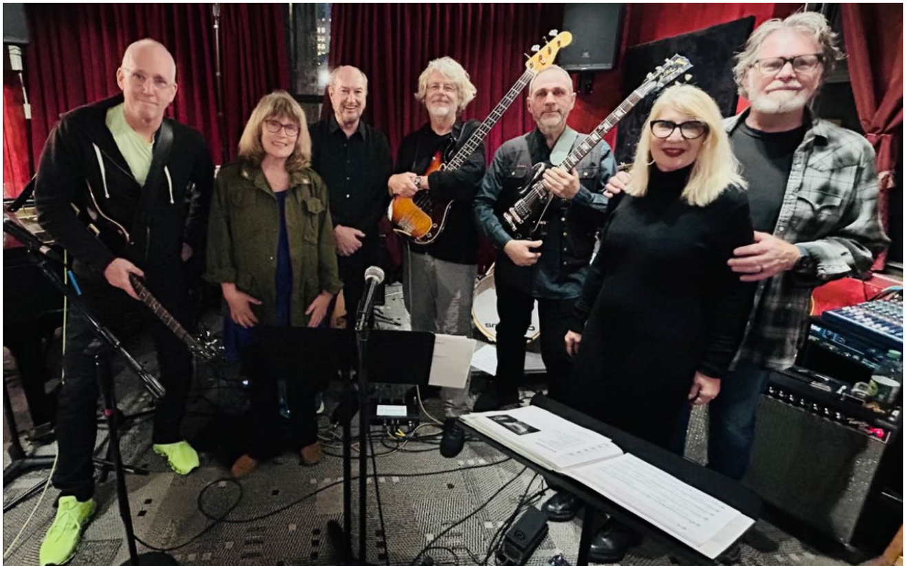
Exposure: open rehearsal, Sept 2024 NYC

Re: this unique staging, Fripp has proclaimed enthusiastic: “Full support and encouragement. Rock out!”